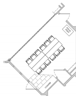
Harbor View Room